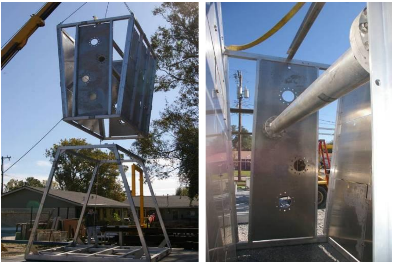
The Multi-Panel Project Platforms: Pipeline Project Showing

The future is looking great for better training projects. The Navy is bringing on board multi-panel projects for uses in the 40 foot pool and a new salvage project called the "HULK". These two projects are going to be incorporated into the 2C curriculum and will start being used very soon, and will eventually be available to outside commands for use when not scheduled for use by the school house; the 7 th Dive has already been eye-balling the opportunity. Hoo-Yah Deep Sea!