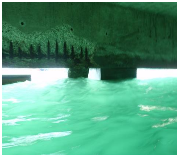
(After Repairs) Forms were placed around each pile and concrete was poured

In closing, thank you to all of the spouses, family, and friends of the 544 th . The 544 th could not accomplish its mission without your support. Please have a safe and exciting summer and always remember to unleash the Kraken! God bless and DEEP SEA!