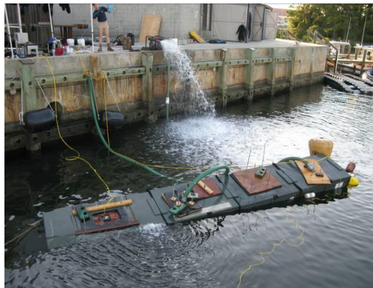
Class 10-10-A2C FTX: Student, Private Booyesen works on rigging the salvage project for towing to the shore while it finishes dewatering