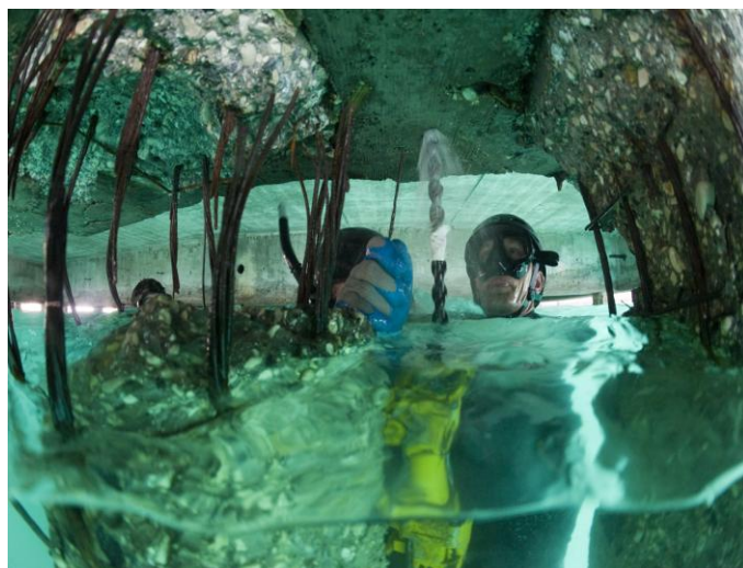
(Before Repair) 80% of all support piles were damaged this badly or worse