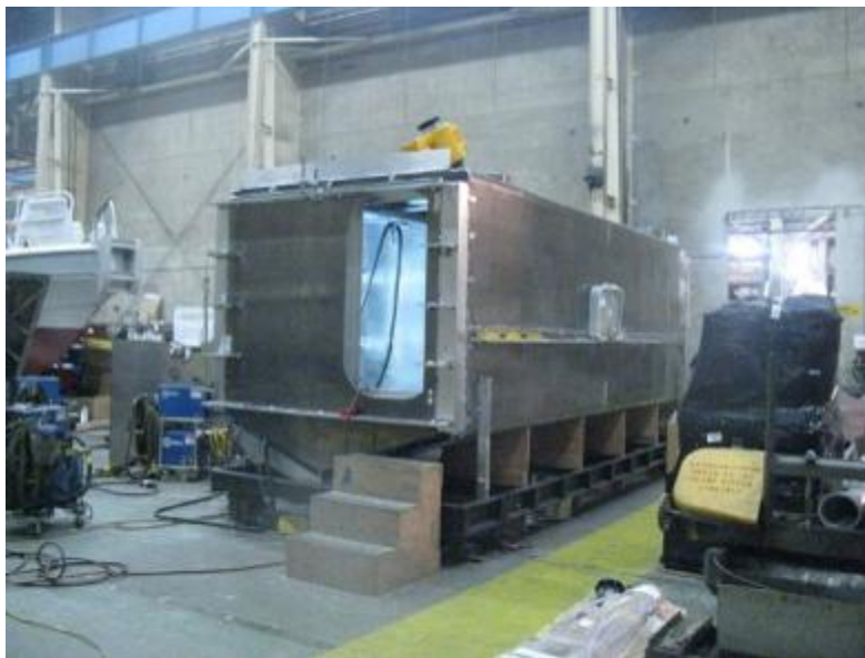
The HULK Salvage Project