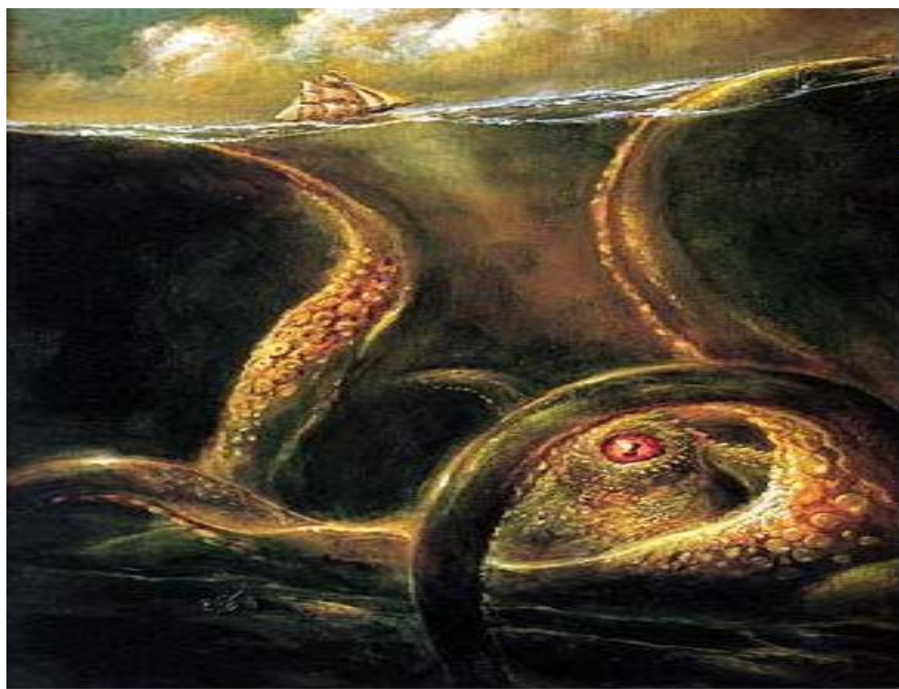
Unleash the Kraken!