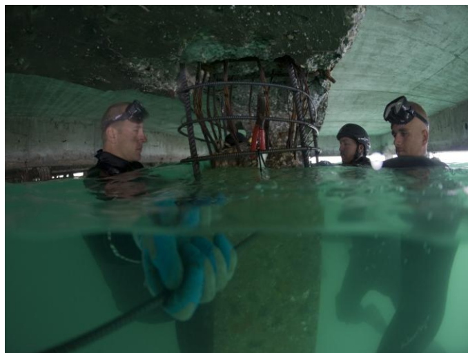
(During Repair) All piles were cleaned, chipped, drilled, and re-forcing rebar was emplaced