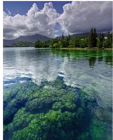
Right: Coral off Coconut Island