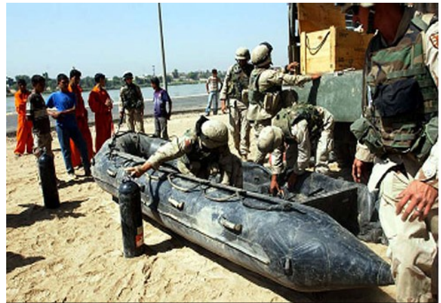
Baghdad Iraq, 2 nd Squad sets up gear for Demolitions job as local children look on

Well, the weatherman is calling for 6 inches of snow over the next two days, which means we will have a White Christmas here at Fort Leonard Wood; something my wife and I have been looking forward to since we have been together. I hope everyone has a MERRY CHRISTMAS and a Happy New Year. Good Speed, Hoo-Ya Deep Sea!!